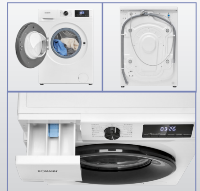
Washing machine WA 7175

Deep cleaning with steam function in specified programs